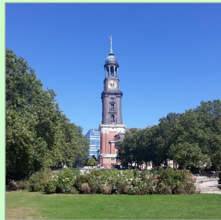
Michaelis church, called „Michel“