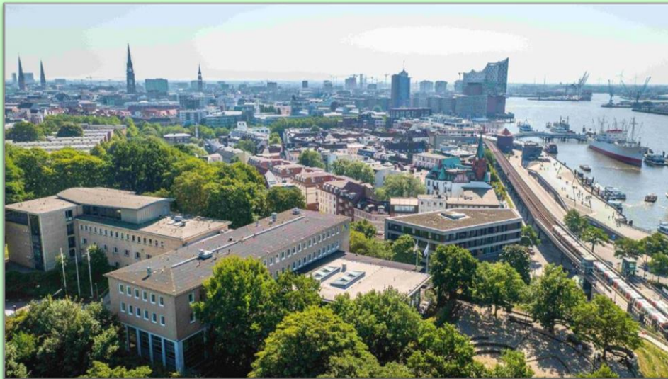
Youth hostel „Auf dem Stintfang”

The hostel has 356 beds, 44 of them I reservated just for you!