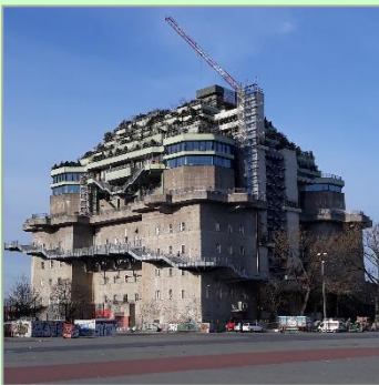
Green bomb shelter St. Pauli

Today we will make a harbour cruise. With the ship we come very close to the docks, shipyards and container-terminals and learn a lot about the largest port in Germany. If the tide is good, we will also see the Speicherstadt, an area with old storage houses (UNESCO world heritage ) from water side. Further we will visit the Hochbunker St. Pauli (if already open). This massive bomb-shelter is a relict from second worldwar. Last year it was supplemented with a rooftop park in a hight of 40-60meters... One of the most spectacular greenroof projects in Europe at the moment! Last but not least we will make a walk (ca.6 km) across the cemetery in Ohlsdorf: It's with roundabout 4 km 2 the largest park cemetery in the world.