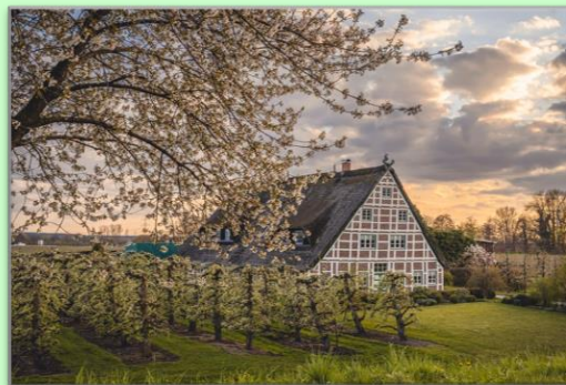
Quelle: www.geo.de/reisen/reise-inspiration/ausflugstipp-norddeutschland )