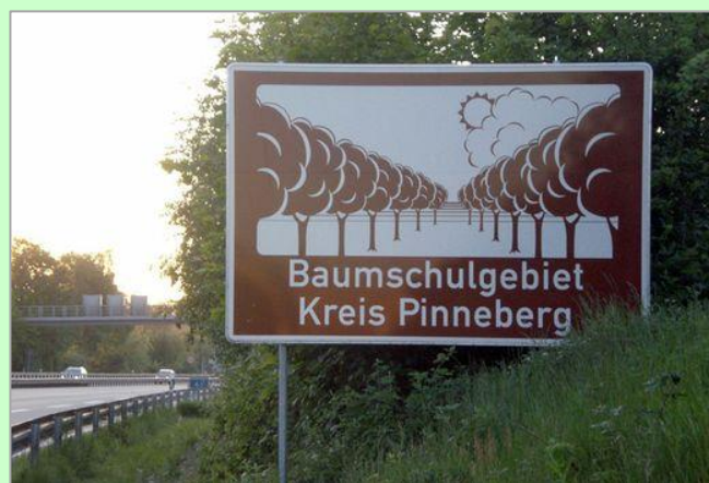
Landkreis Pinneberg

Further we will join the Arboretum Ellerhoop, an amazing and very beautiful botanical garden.