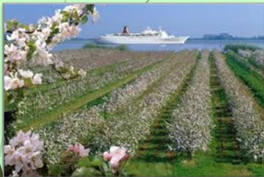
Altes Land

Today we drive with a bus to southside of the Elbe. Here we will visit the tree nursery Lorenz von Ehren: With a production area of 600 ha and 200 employees one of the biggest nurseries in Europe. After that we drive across the area of Altes Land: This historical cultural landscape is with 10500 ha production area one of the largest fruit growing areas in Europe. Here we will visit the fruit growing company Schliecker, who produces on 70 ha apples, pears and cherries in third family generation.