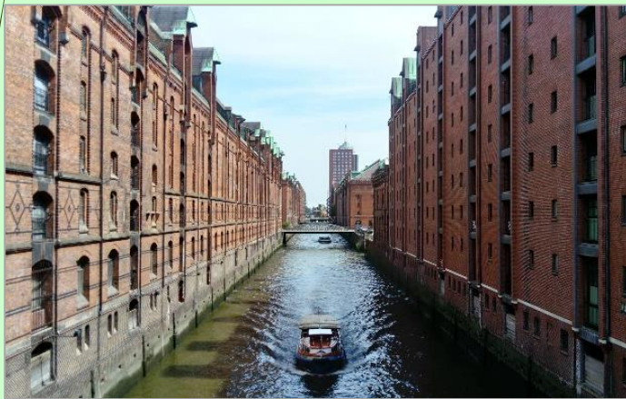
Quarter of old storage houses

In the morning we will visit the fishmarket, what takes place since the year 1703 every sunday at the port. Today there you don´t get just fish, also all varienties of food, flowers, clothes, souvenirs, further crazy people and livemusic. There is no better place to breath the unique spirit of Hamburg! In the run of the day we will make a sightseeing tour by walk (ca.8km), where you will learn to know some oft he the most popular tourist attractions: the Michaelis church, philharmonia, townhall and „Planten un Blomen“, the most beautiful and spacious park in the center of Hamburg. In the evening we have general meeting (8:00-9:15p.m.)